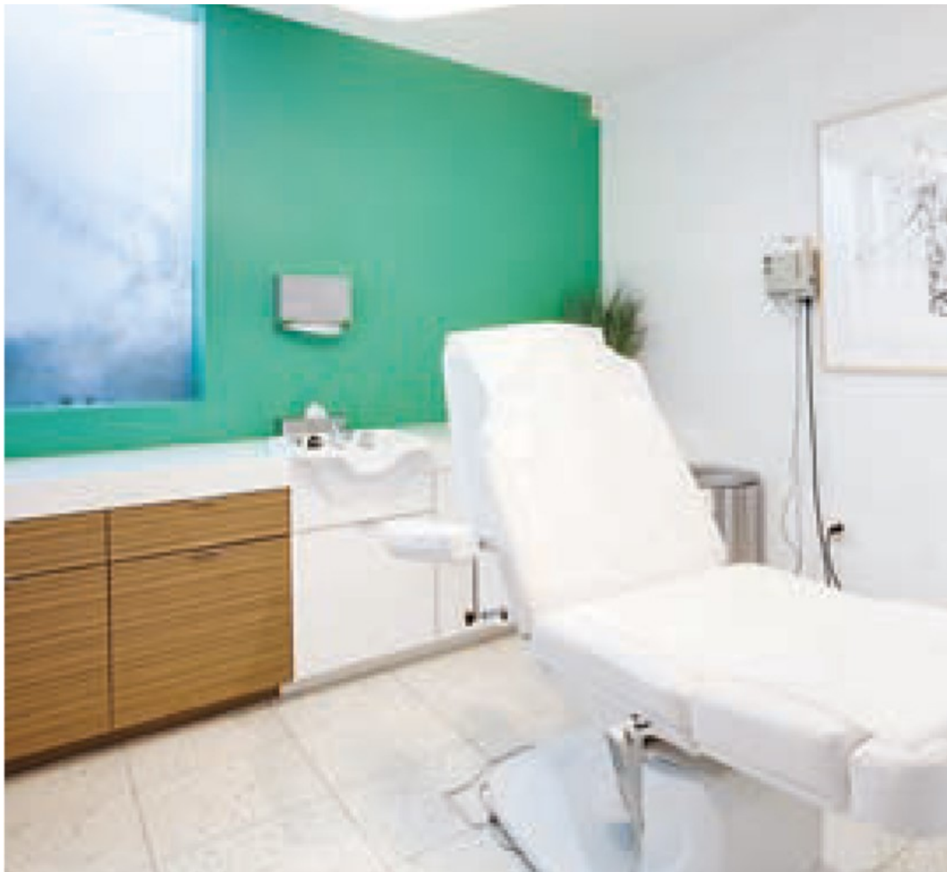
AVA MD BH Treatment Office