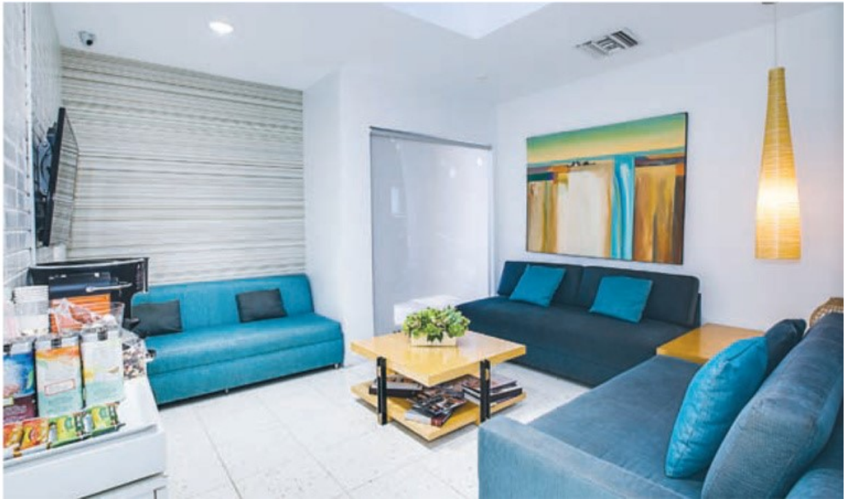
AVA MD BH Waiting Lounge